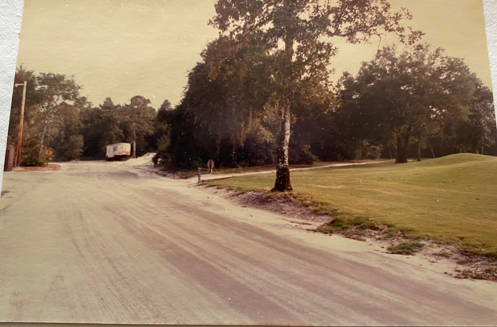
SOUTH VIEW ALONG ROBIN ROAD WITH PHASE III AND HOLE 11 OF GOLF COURSE ON THE RIGHT