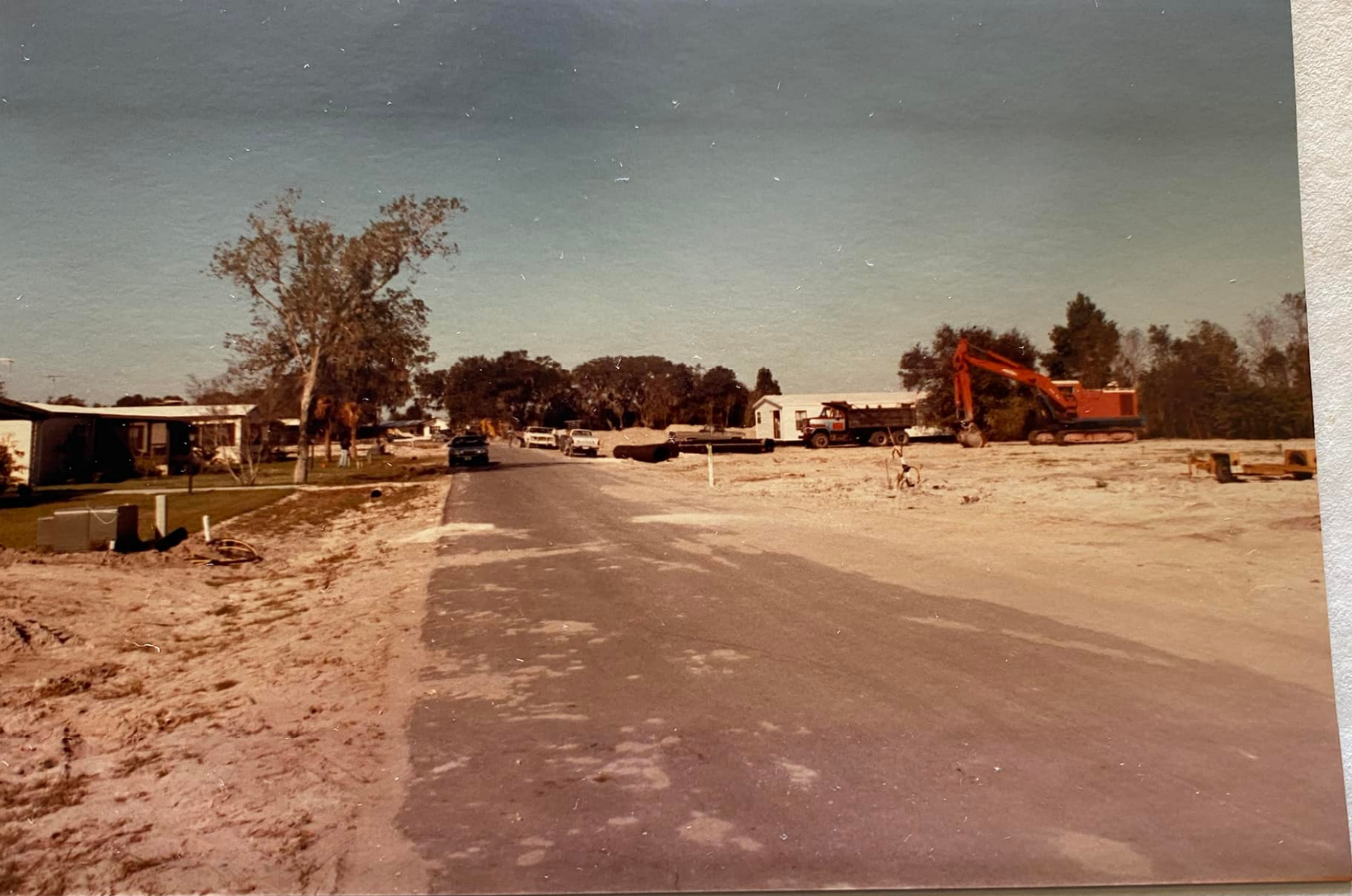
TYPICAL PHASE I DEVELOPMENT