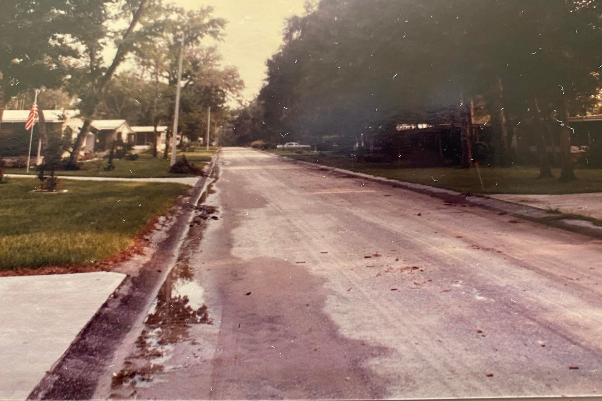
TYPICAL INTERIOR ROAD - PHASE II