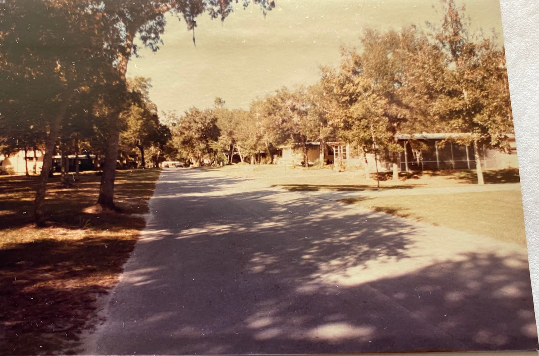
OLDER DEVELOPED AREA OF PHASE I