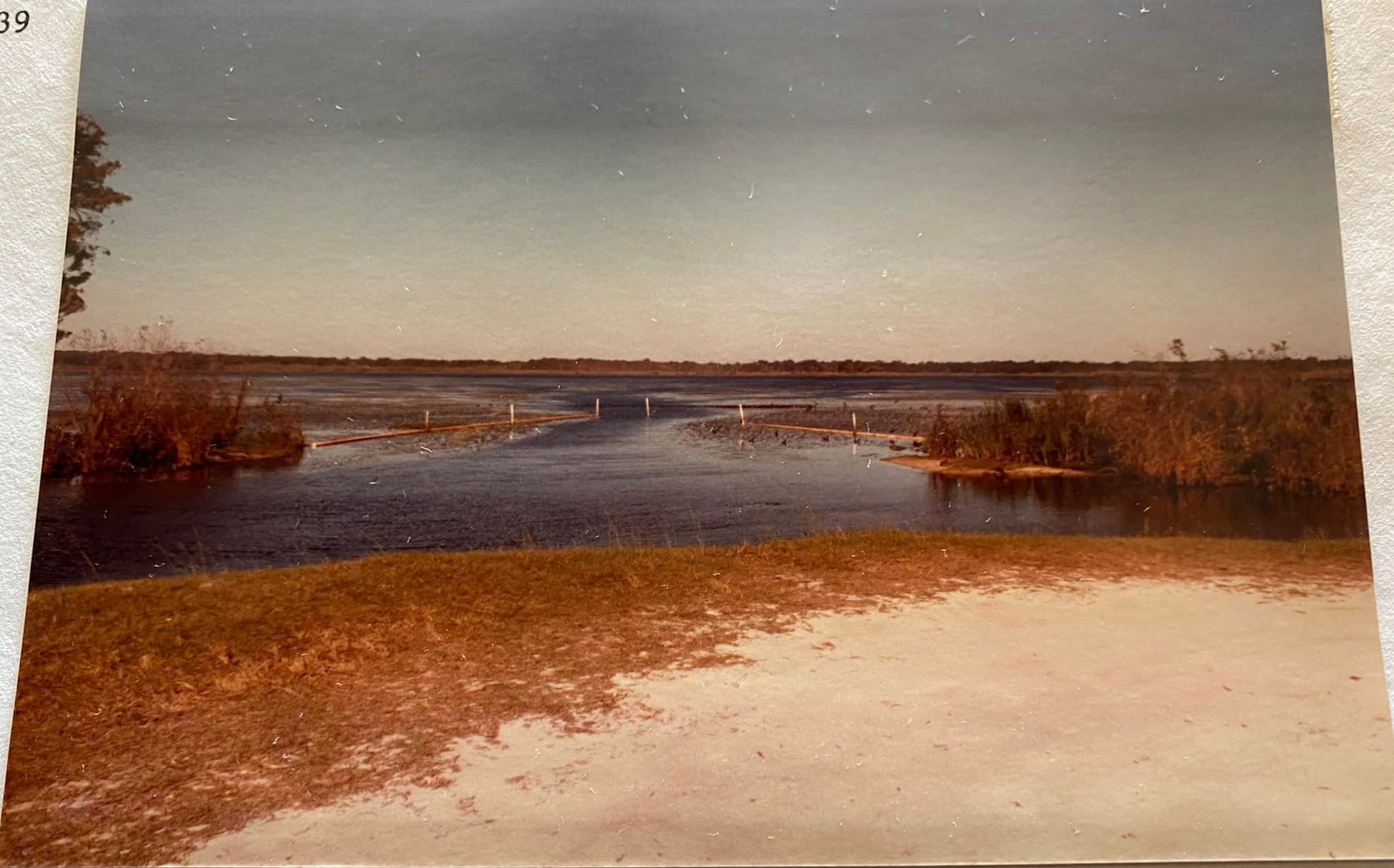
WEST VIEW OF COMMON AREA ON LAKE OKAHUMPKA