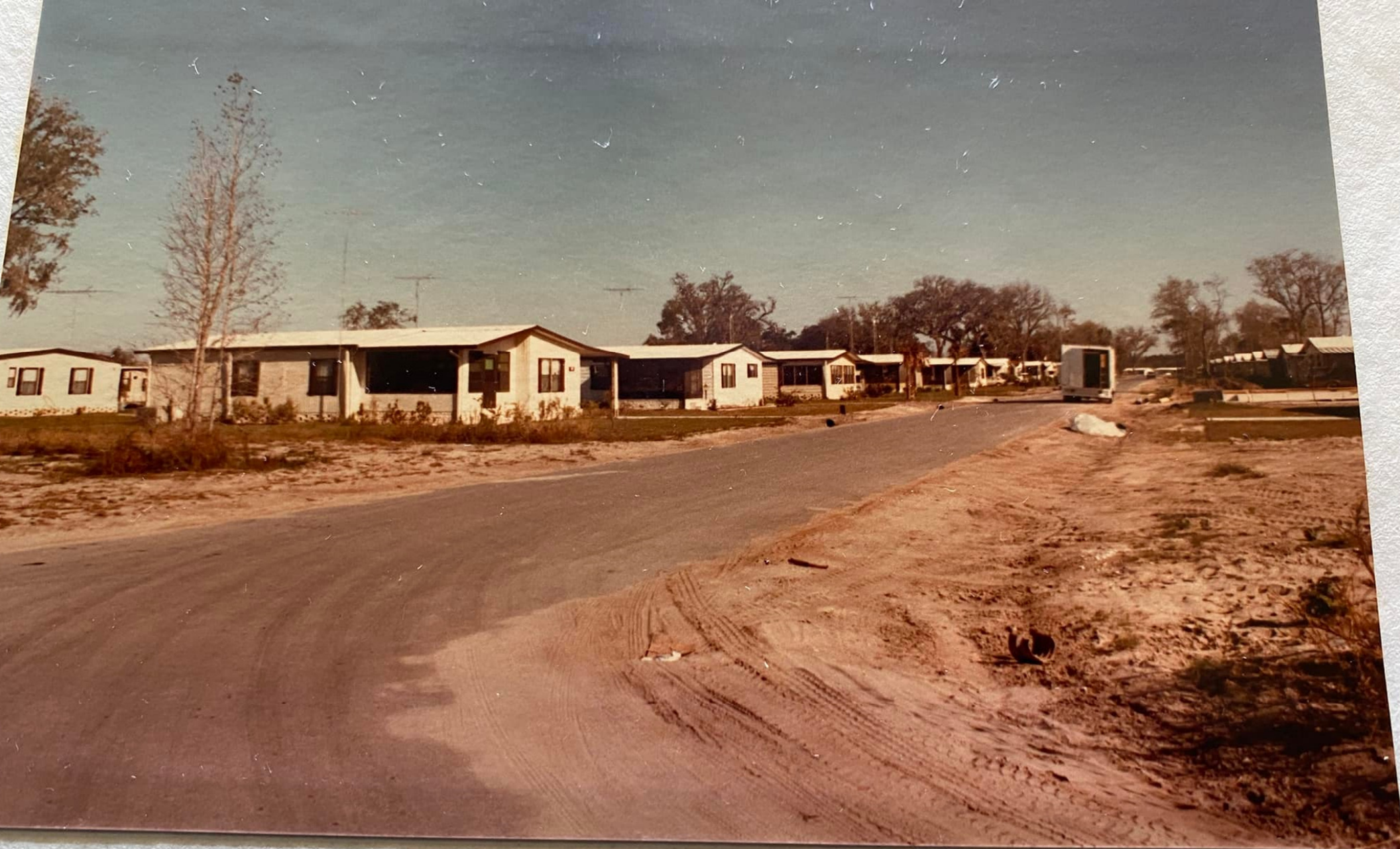
TYPICAL PHASE I DEVELOPMENT