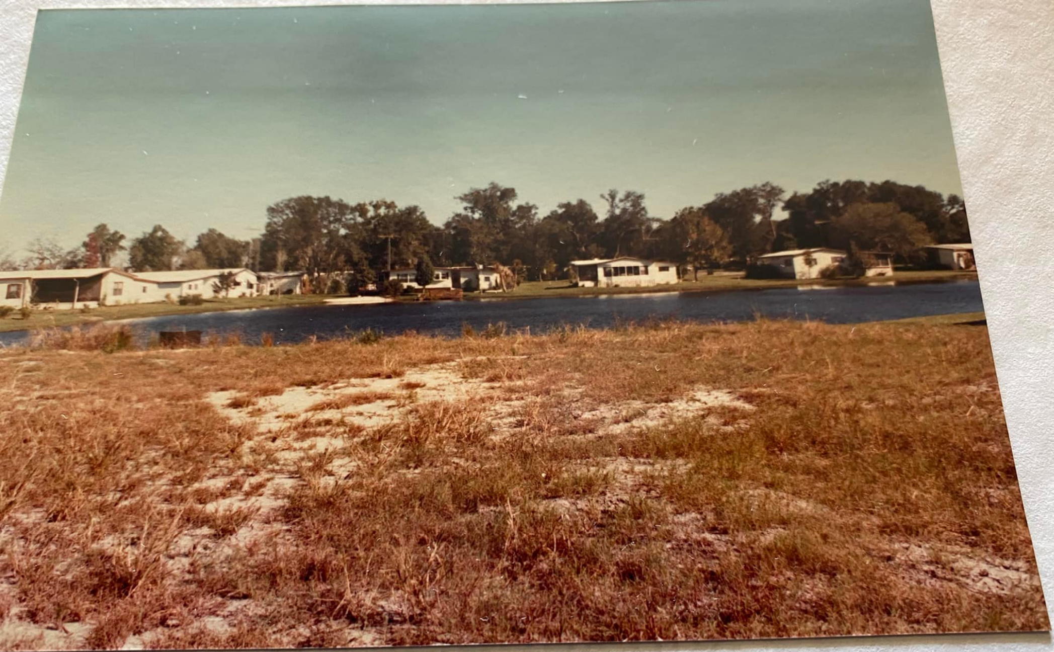
ATTRACTIVE RETENTION POND - PHASE I