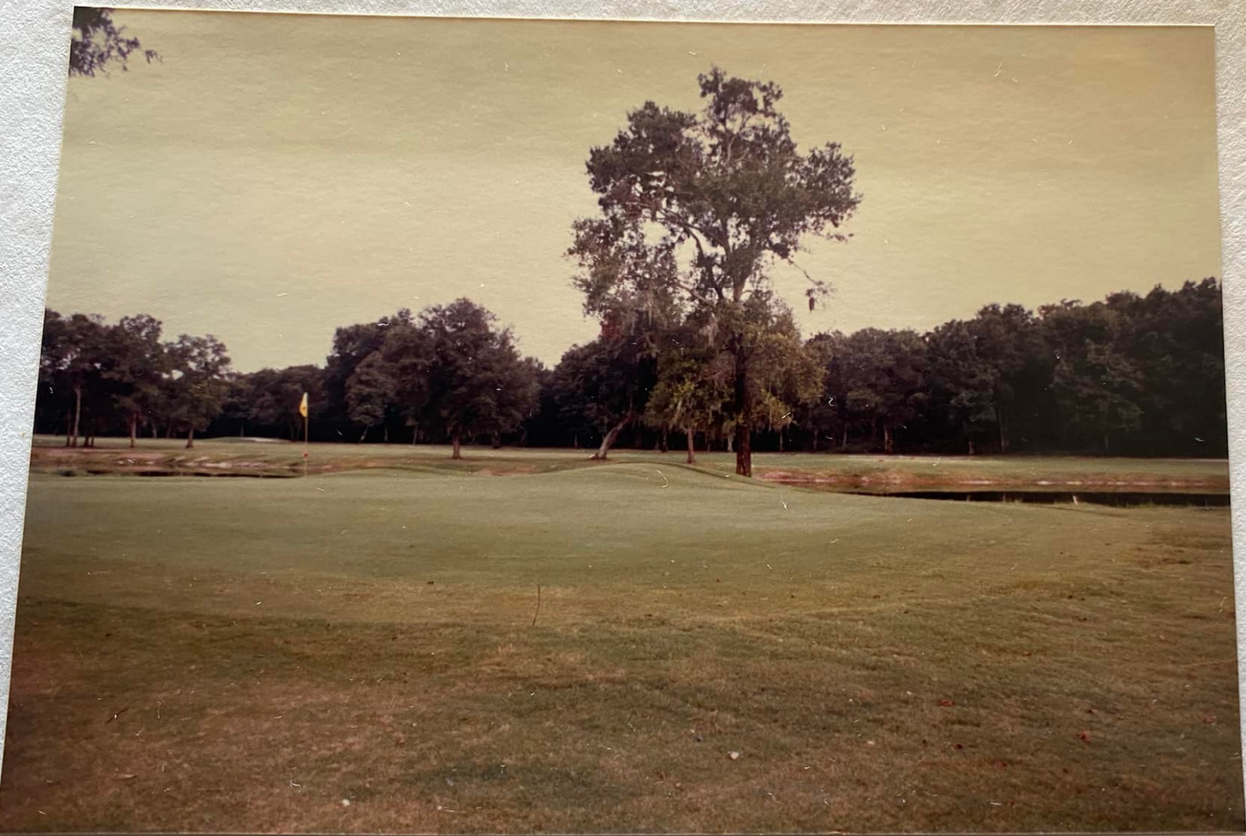
SOUTH VIEW OF HOLE 12 GREEN WITH GOLF FRONTAGE OF PHASE III TO THE REAR