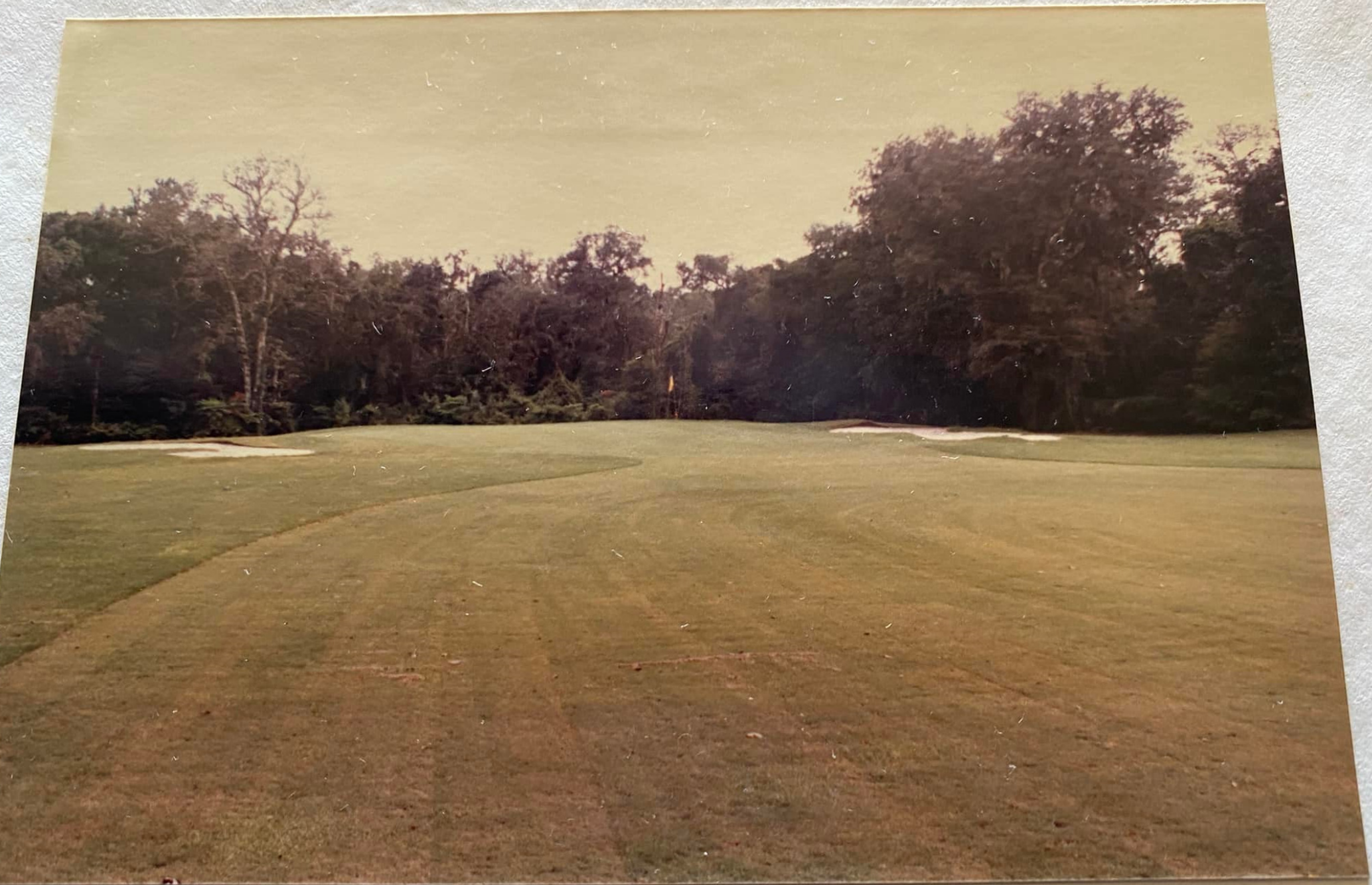
SOUTH FAIRWAY VIEW OF HOLE 13 WITH PROPOSED BLOCK 17 TO THE REAR