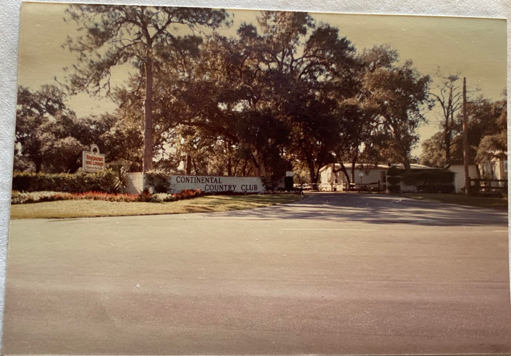
VIEW OF MAIN ENTRANCE OF CONTINENTAL COUNTRY CLUB ON STATE ROAD 44