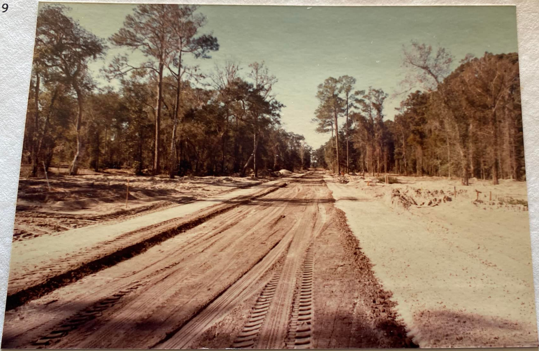
TYPICAL DEVELOPING AREA IN PHASE II