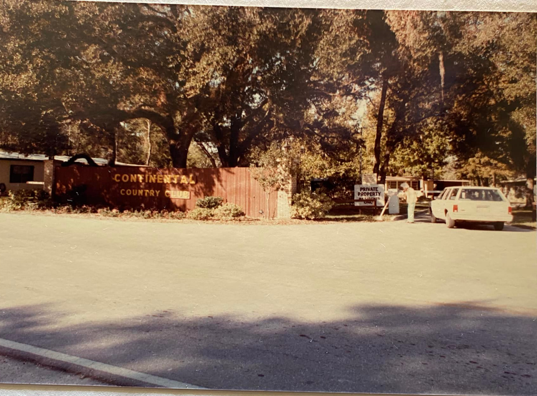
CONTROLLED ENTRANCE ALONG STATE ROAD 468 INTO PHASE II