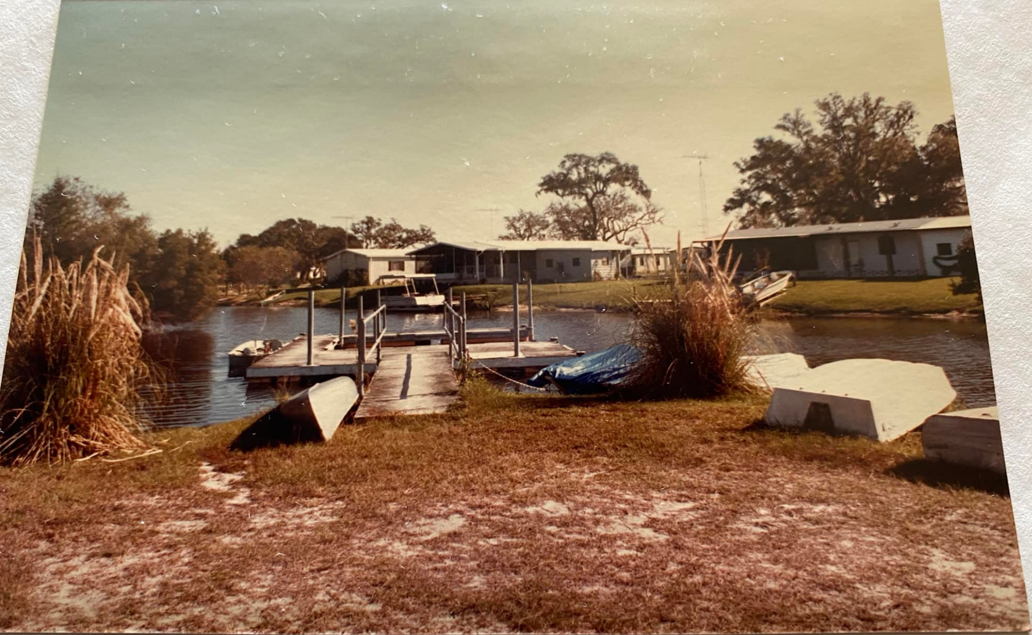
BOAT DOCK AND CANAL IN PHASE I