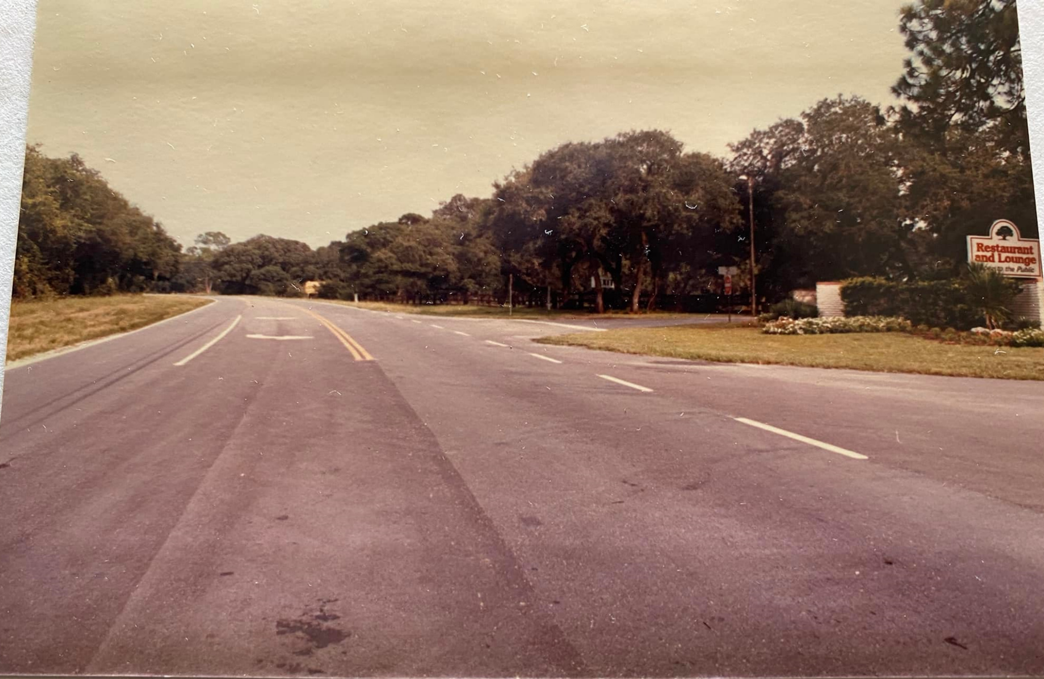
EAST VIEW ALONG STATE ROAD 44 WITH SUBJECT ON THE RIGHT