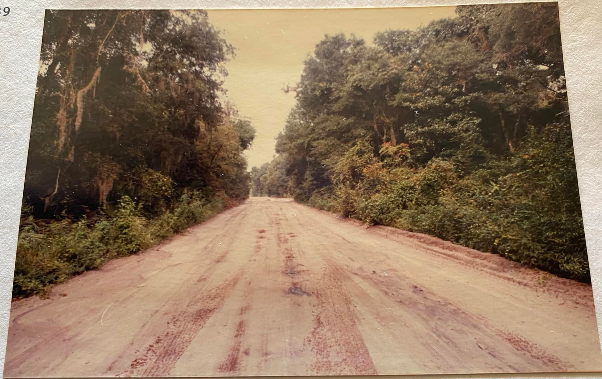
TYPICAL INTERIOR VIEW OF UNDEVELOPED PHASE III LAND