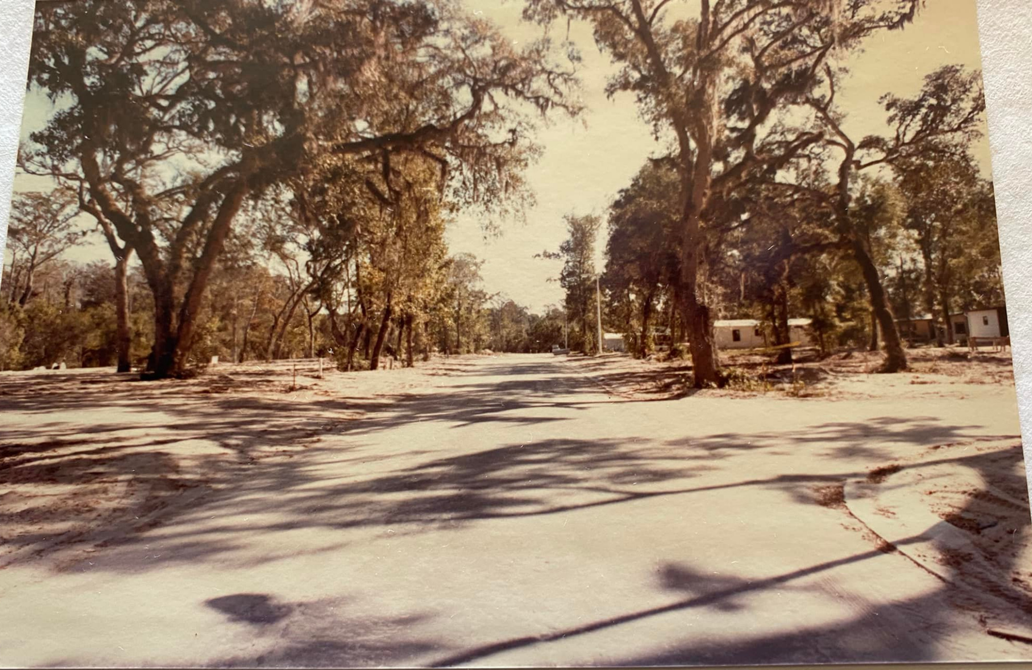
TYPICAL DEVELOPING AREA IN PHASE II