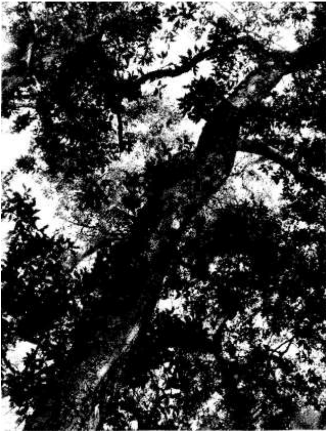
The last surviving Champion Tree, a Common Winterberry, is seen here as it was in the spring of 1978. It is 40' high with a 16' spread and is located near the 12th green. It now leans almost parallel to the ground.

"Mr. Hester located the trees on land east of Wildwood, which he recently sold to Continental Camper Resorts, Inc.