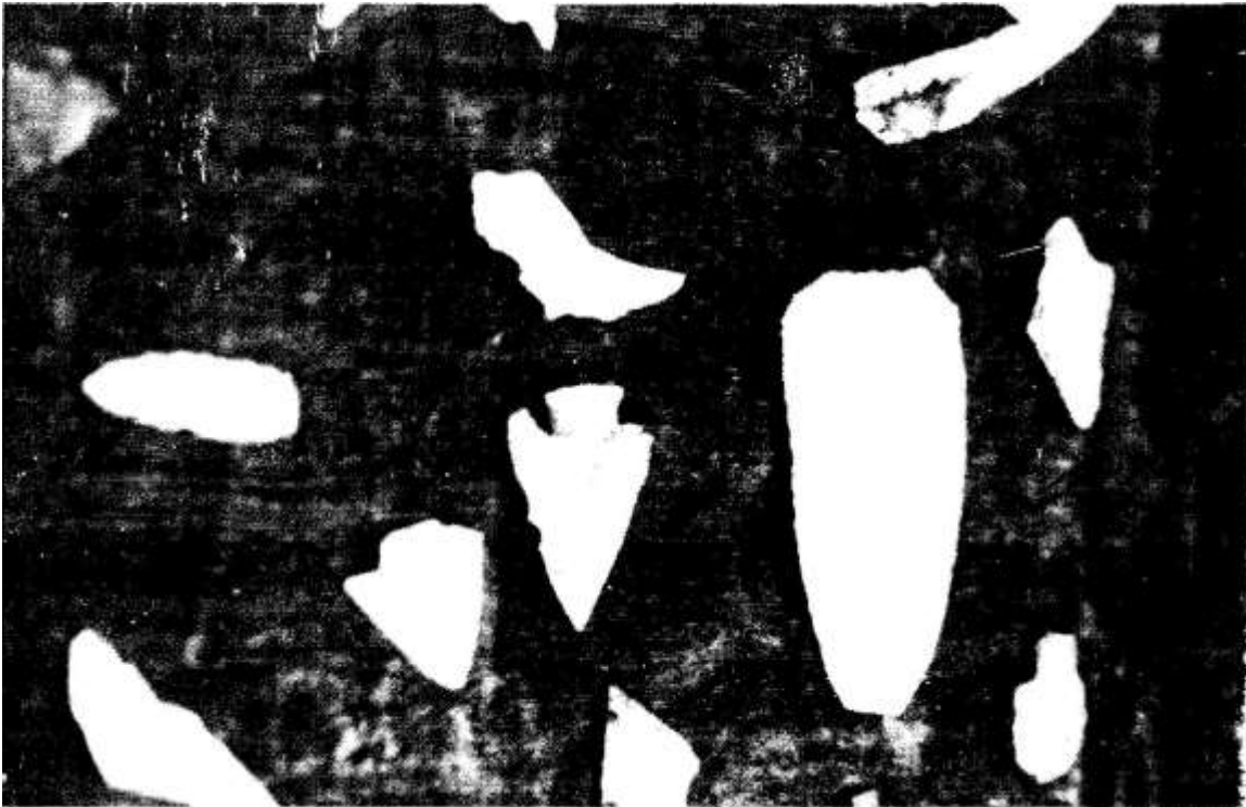
Part of the Hester collection of Indian arrowheads.

" Florida, " the 1939 WPA guidebook, tells what tribesmen and tribeswomen wore: 'Clothes were for ornament. Men wore brilliant feather mantles, metal breastplates and leather breechclouts. The typical brave wore inflated fish bladders, dyed red, in his ears. An Indian woman wore a moss skirt and mantle and her hair was unbound.'"