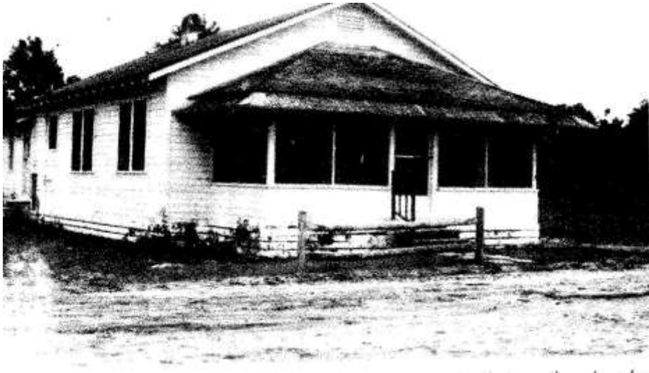
Hester House, weekend home of the Hester family and later the first meeting place for CRLC.

There was a pond just below the Hester House and opposite the laundry room (now the ceramics building). It was dredged and stocked with fish for weekend sport. Later it was enlarged and named "Golden Pond."