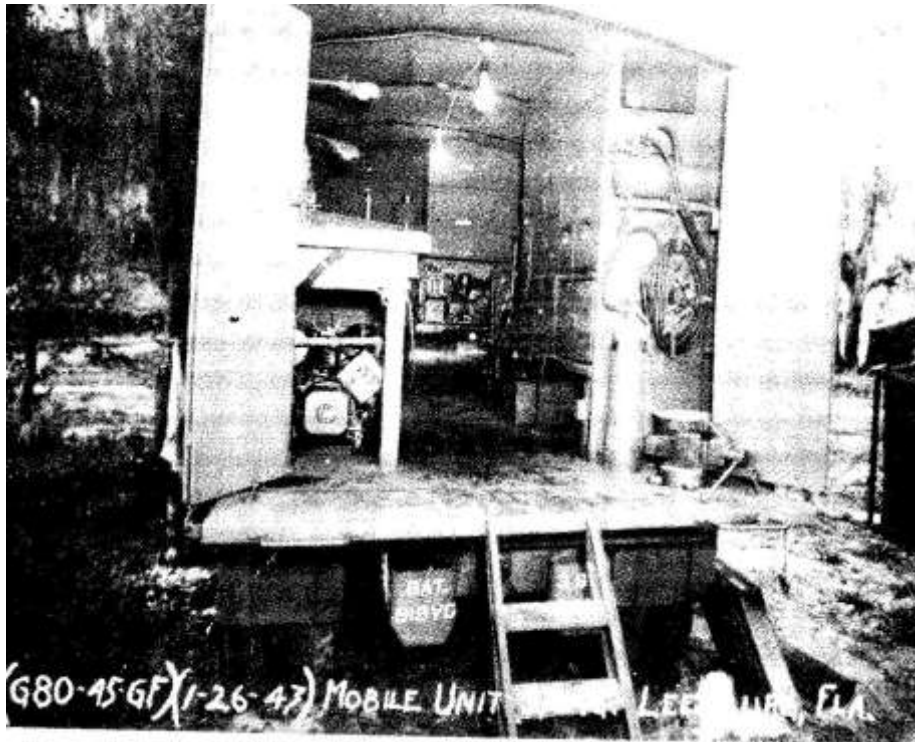
Equipped and ready to roll ... Pictured here is one of the mobile units used in WWII ready to roll to a nearby airport and equipped to repair airplanes.

They also salvaged parts from wrecked planes. The trucks had canvas tops, with a big boom in front. Nick commanded 22 men and trained 332 men to form other service units to go elsewhere. His sheet metal base shop was at the site which is now Rail's End, at the spot where the railroad caboose now rests.